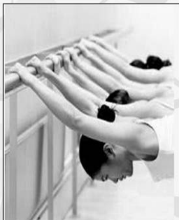
B ARRE ROUTINE